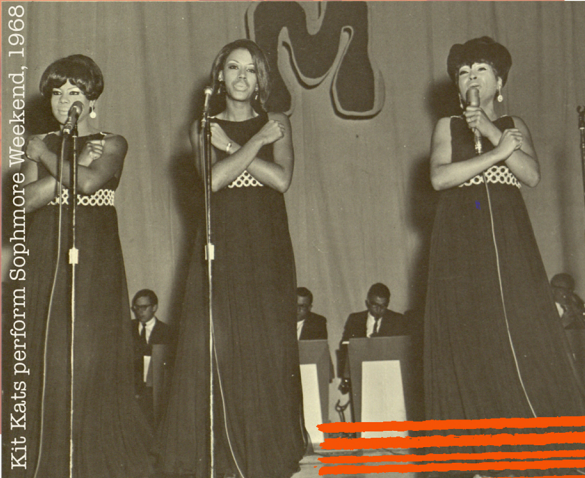
Kit Kats perform Sophomore Weekend, 1968